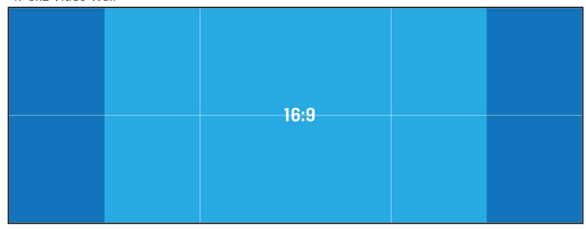
Figure 2 Illustration of different screen layouts that may constitute a primary viewing area. Of these option 3 is the only one we have not seen in UK bars carrying sport.

• It is bad practice to offer more than one representations of the game as a whole within the primary viewing area. This is why the design choices iterated towards offering additional shots of the manager and the crowd.