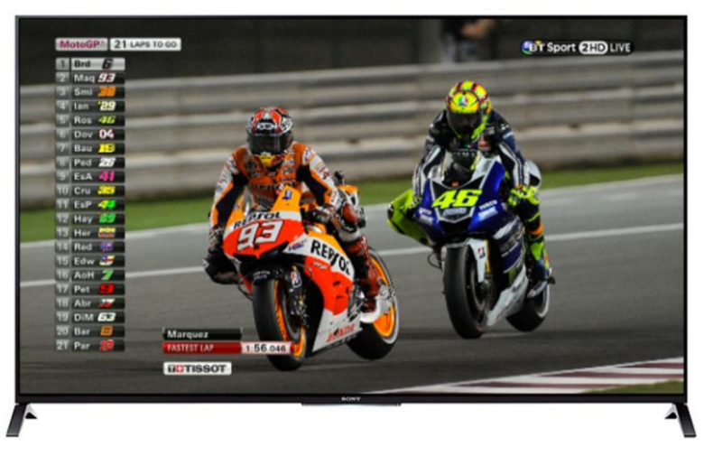
Figure 4 Showing the leader board scaled from a size readable on 32" screen (the left hand screen). When scaled to the 65", the TV on the right, the text becomes unnecessarily large and occupies too much screen real estate. (The example is more convincing on actual size screens)