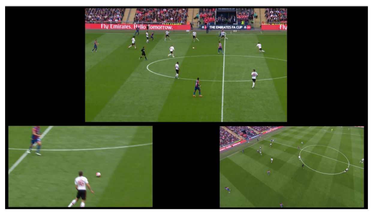
Figure 3 A screen grab from a render of showing three synchronised shots taken from the match. Whilst not obviously incomprehensible as an image - the video version soon becomes very uncomfortable to watch.

• The choice of shots of the manager and the crowd plays to the tribal nature of the occasion and helps build empathy, for the partisan viewer with their 'tribe' placed in the stadium by allowing you to observe and mirror the behaviour of the leader (the manager) and of your supporter peers.